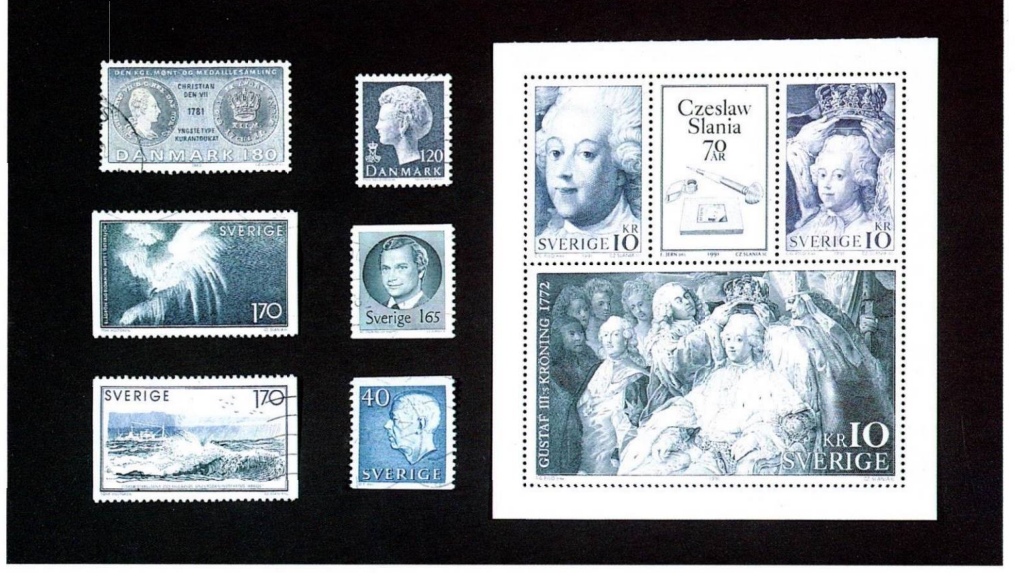
Slania stamps of Denmark and Sweden with Sweden's 70th birthday tribute