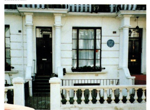
Marconi's home at Hereford Street, London W2